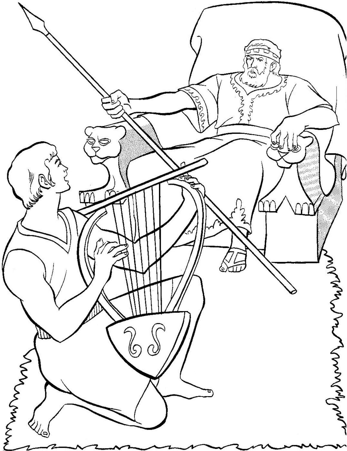
David plays the harp for King Saul